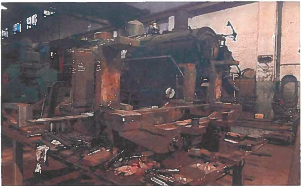
Above, work continues on Locomotive 81's pilot truck. We will have her steaming in January. Below, Locomotive 93's axle is back waiting for installation.