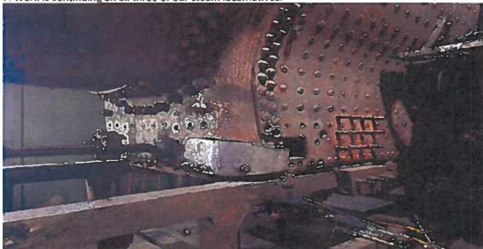
Locomotive 40 received throat sheet repairs.