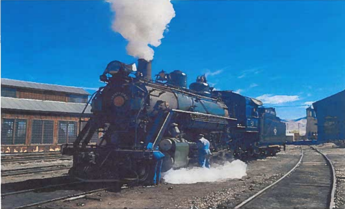
After lots of hard work by staff and volunteers and financial support from our members, Locomotive 81 is back in service!