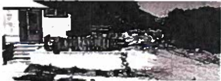
Ely Neighbors of Cedar Street and Campton

Anthony Ithurrealde read the following letter into the record: