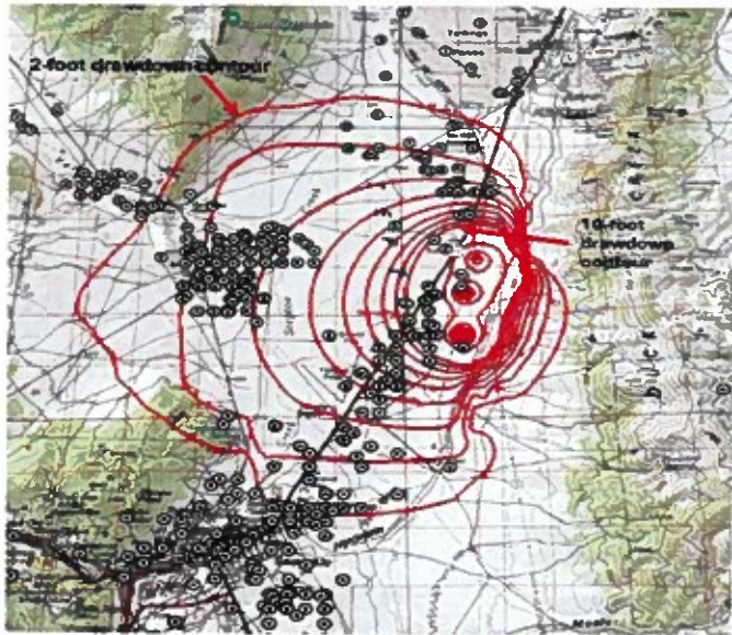
Figure 14 (A. Zdon. Roux, Inc., Memorandum Groundwater impacts of the proposed White Pine Pumped Storage Project, Steptoe Valley, Nevada (July 8, 2024)).