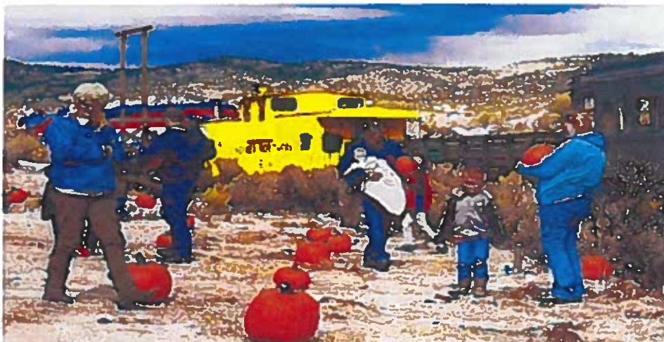
Our signature events in October are the Pumpkin Patch Caper (above) where passengers get to choose a pumpkin to take home. On the last two Fridays and Saturdays in October the Haunted Ghost Train pulls out of the station with a strange crew!