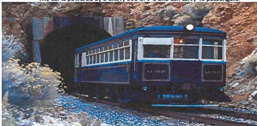
The car has already been used in service and lived up to our expectations. Our current plan is to leave it in its current paint scheme but change the letterboard lettering from Secret Valley Traction Company to Steptoe Valley Traction Company.