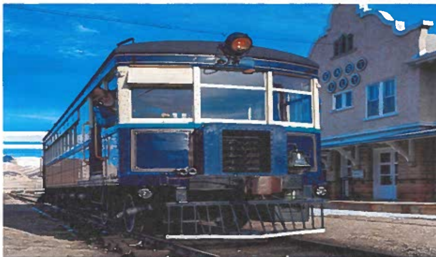
The car is powered by a Chevy 396 CI V-8 and can carry 40 passengers.

Best Adrenaline Rush in Rural Nevada – 2020 Best Historic Railroad of the West – 2023, 2022 Best Museum in Rural Nevada – 2022, 2020, 2017, 2016, 2014, 2013, 2010, 2009, 2008 Trip Advisor Certificate of Excellence – 2024, 2023, 2022, 2021, 2020, 2019, 2018, 2017, 2016, 2015, 2014 Best Place to Take the Kds in Rural Nevada - 2020, 2019, 2018, 2015, 2014, 2013, 2012, 2011, 2010, 2009, 2008, 2007