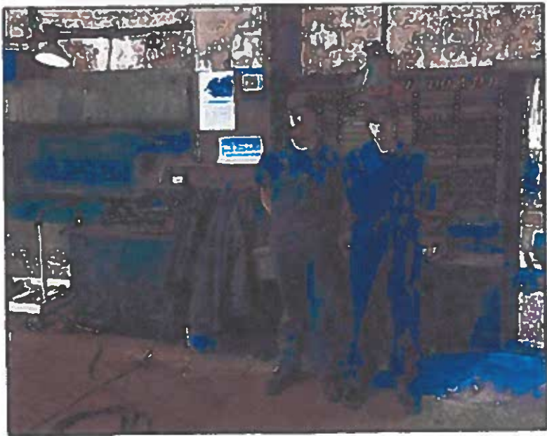
Above Lennox signing in for service at the cleaned-up call board.