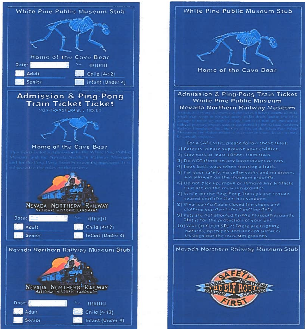
Joint admission ticket for access to both museums.