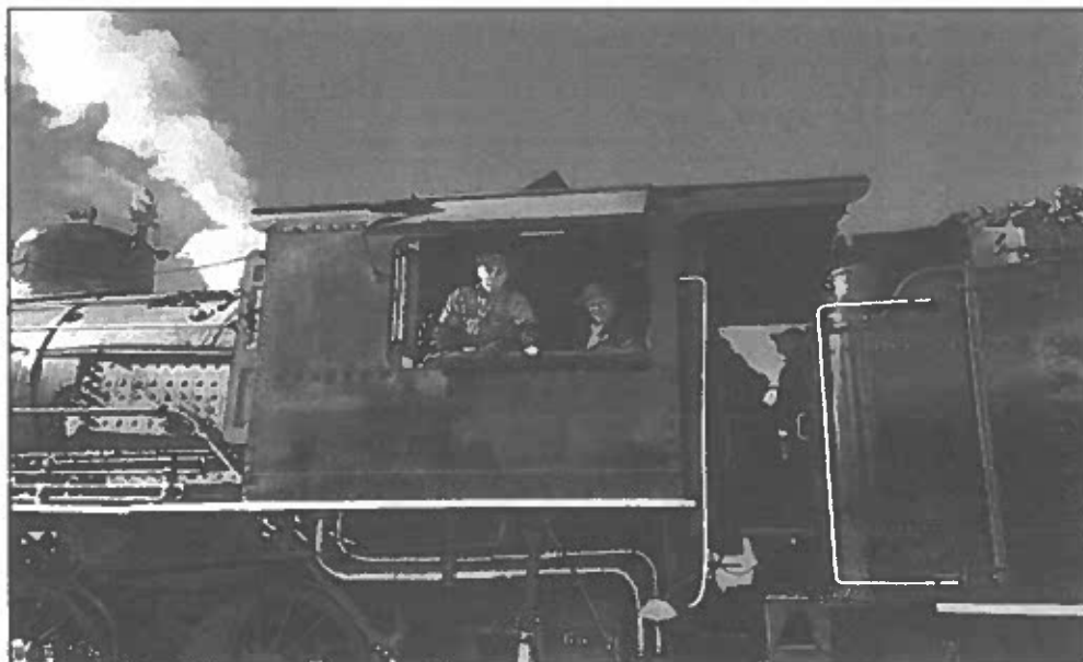
Nevada Lieutenant Governor Stavros Anthony tour the railroad and watched the eclipse from here.