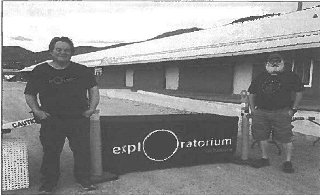
The Exploratorium was here for the eclipse and broadcasted the eclipse live from the railroad and Jack Caylor Park. We had over 2,000 people visit the railroad that weekend.