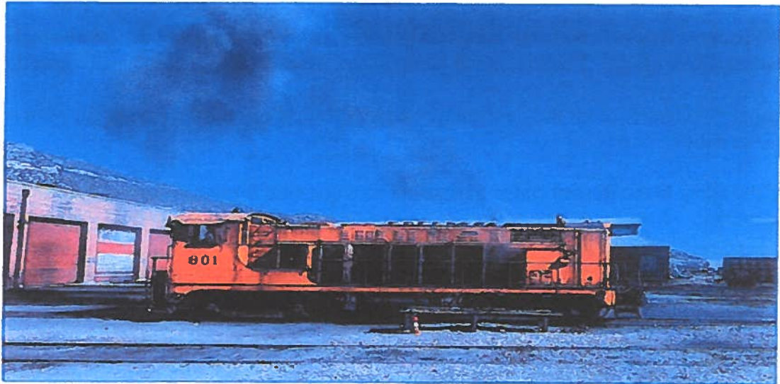
Locomotive 801 starting up for the first time in 39 years!